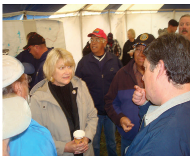
Cynthia Lummis visits with Volunteers.