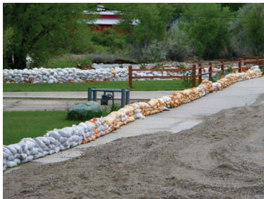
Sand bag operations took place June 5 through about June 16.