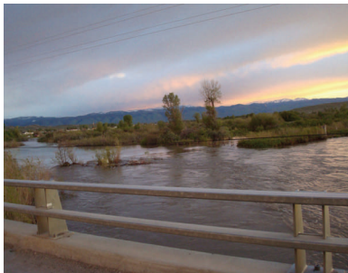
The Little Wind River Bridge