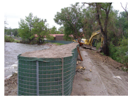
Hesco Baskets were used to build a wall in Lander.