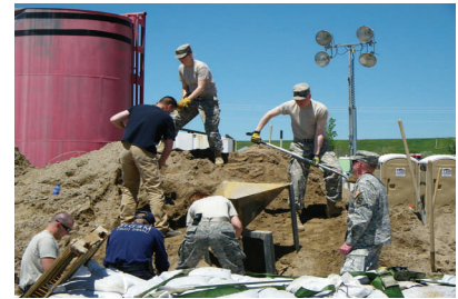
National Guard members handled much of the sand bag operations.