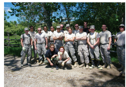
All of Fremont County says Thank you!