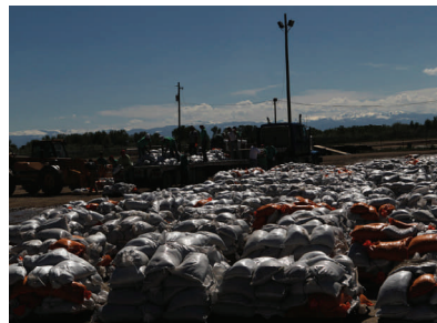
An estimated 500,000 sand bags were used throughout the county