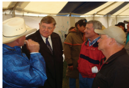
Governor Freudenthal talks with Fremont County Commissioners