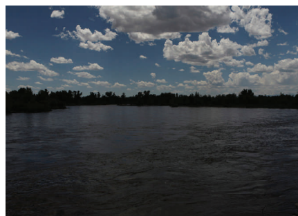
Now that is a lot of Water!