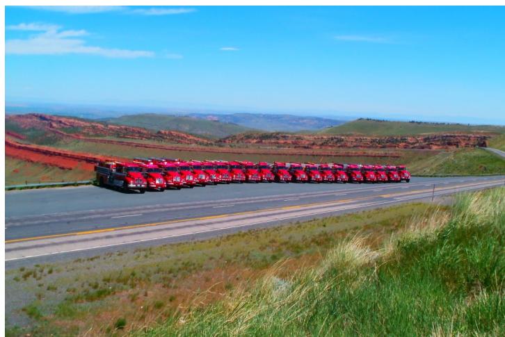
The District paraded all twenty of our Pierce Units up to the top of Red Canyon for this beautiful picture.