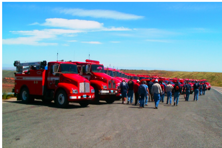
District personnel enjoyed a beautiful sunny morning in June atop Red Canyon.