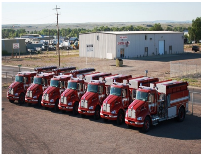
The seven new Pierce trucks are here.